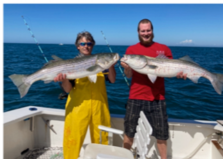
6th Annual Little Big Fishing Tournament