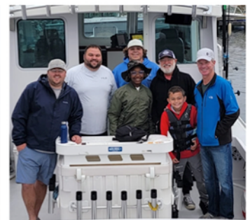
Take a Kid Fishing Tournament