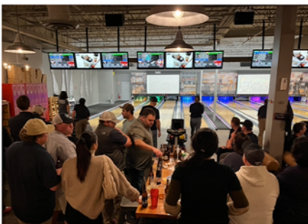
Bowling for Beds to support HAC