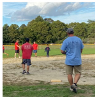
Annual Softball Game & Cookout