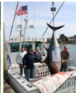
Hyannis Giant Bluefin Tournament