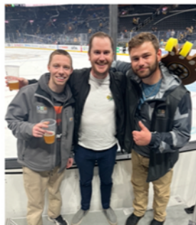
Boston Bruins Game