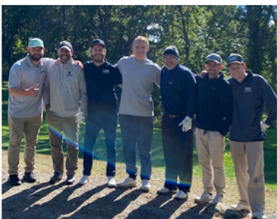
CCLA Golf Tournament