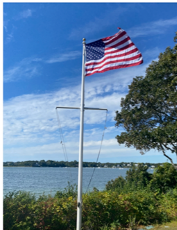
A flagpole at a beautiful home in Osterville, MA

ADD LIGHTING TO YOUR EXISTING FLAGPOLE!!