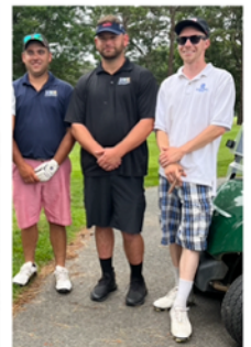
HBRACC Golf Tournament