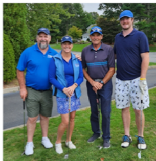
Cotuit Library Golf Tournament