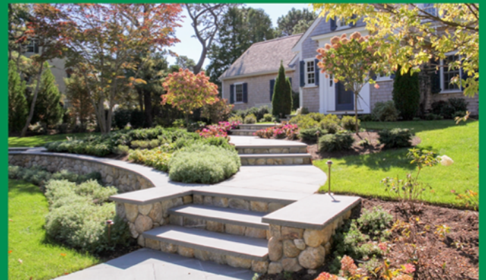
Large landscape construction project completed this past summer in Oyster Harbors, Osterville.